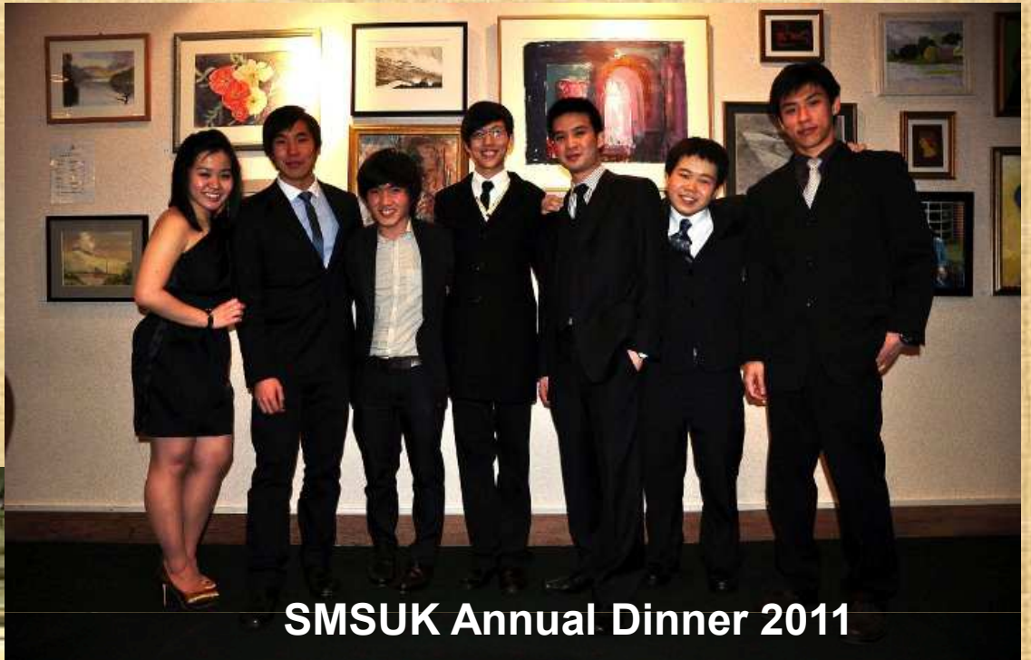
SMSUK Annual Dinner 2011