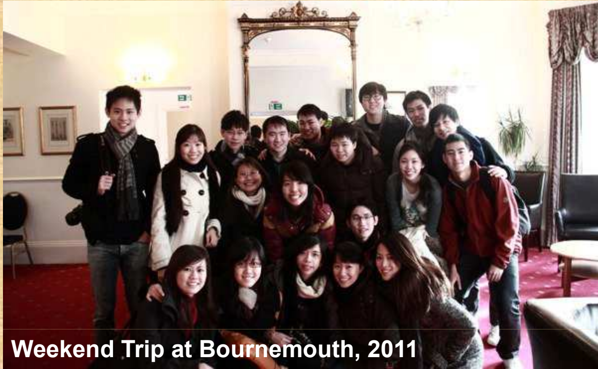
Weekend Trip at Bournemouth, 2011